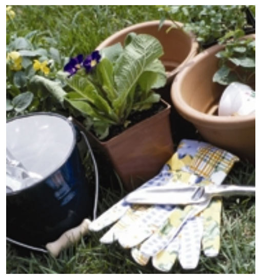
Gardening burns calories and improves diet.

herbs, a garden reminds us of our connection to life and the abundance that nature so freely gives.