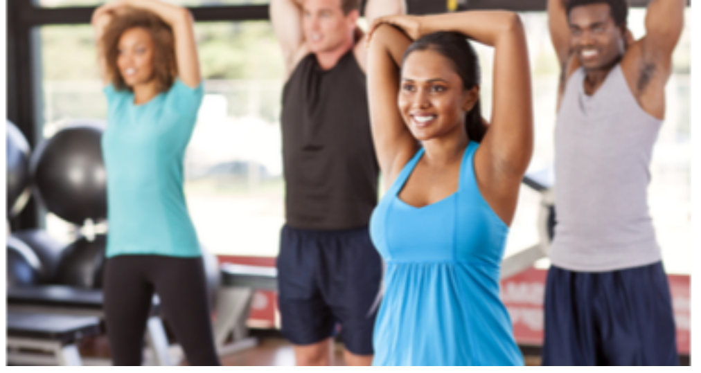
Moderation is key when beginning a new exercise program

Does It Have to Be All or Nothing? We all know that starting an exercise program doesn't actually mean we'll finish it. When we throw ourselves into an ambitious new routine, we are likely to overdo it and get hurt. Then, we get discouraged, and may give up entirely, only to start the cycle over in another year or so.