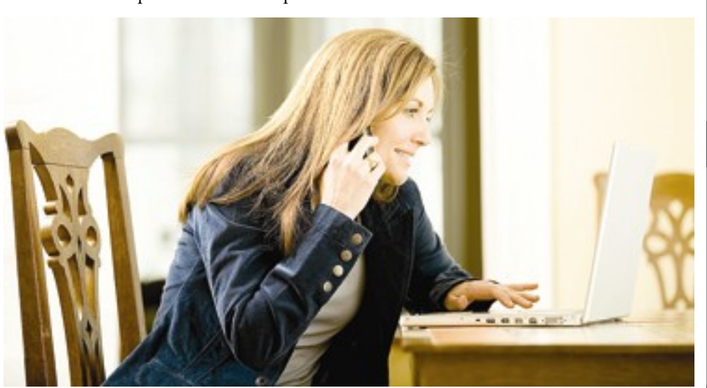
Working in front of a computer often leads to poor posture. Learn how to counteract the effects.

Embrace and love your body. It's the most amazing thing you will ever own!