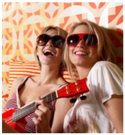
Surrounding yourself with happy people is healthy!

What's one way to get happy? Try massage! Exposure to stress, a contributing factor to unhappiness, over a long period of time can increase the rate of neural degeneration and increase the risk for Alzheimer's disease. Luckily, a study from Umea University in Sweden has shown that just five minutes of massage has the potential to lower stress, and 80 minutes of massage has a tremendously positive effect on stress levels. Get massage, get happy, and cheer up your friends and family!