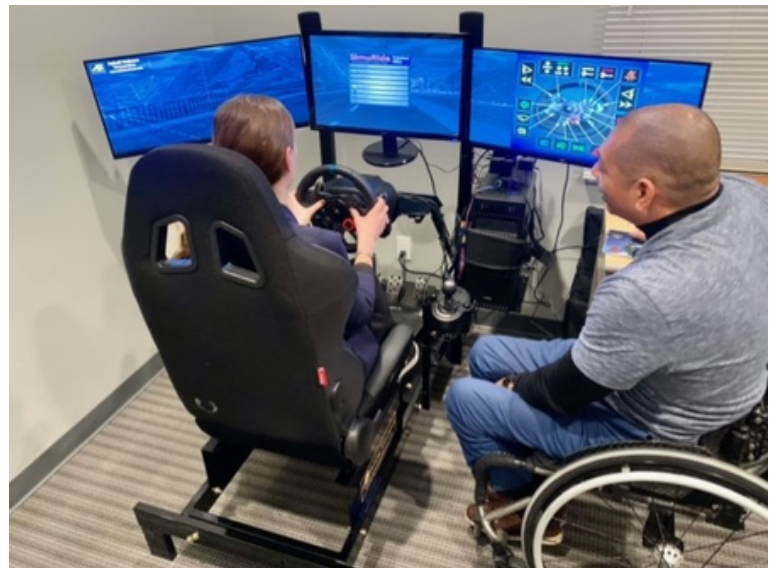
Image text: Image below shows the backs of two individuals and person on the left is using driving simulator rig while person on the right is watching over.