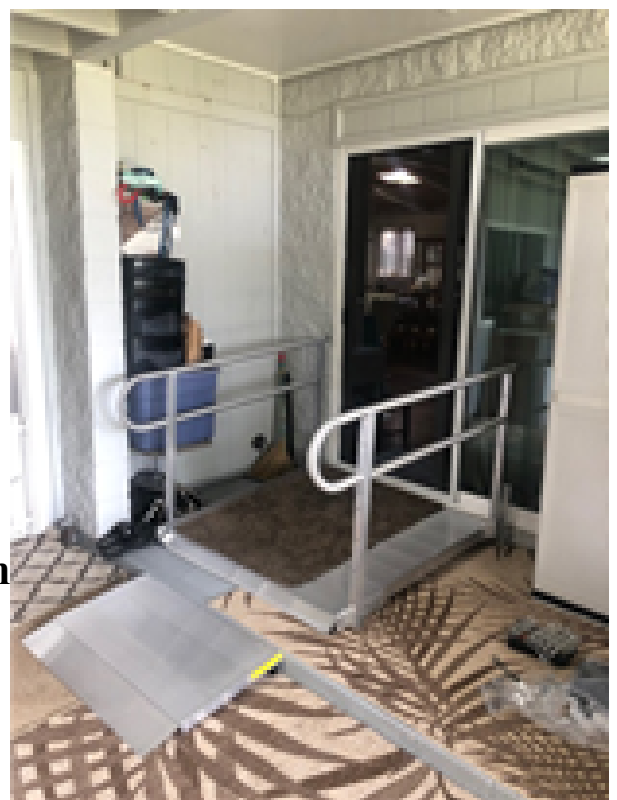
Image Text: Photo shows a white room with an access ramp to enter the door.

For more information on the Program, please contact: Rose Camacho, Transition & Diversion IL Services Coordinator, RCamacho@accesstoIndependence.org, (808) 369-9521 EXT 506