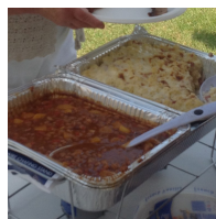
BBQ Peach Beans & Mac n Cheese