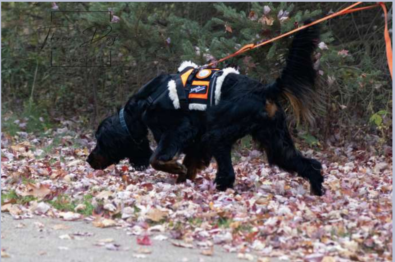
Dougal - Raritan's Down Under Dream AKC SAR-W, CGCA, TKA

Dougal Photos: Three Dog Photography, Cass Rocha, Ohio, USA