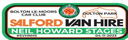
Door Crest Decal

Please note that door numbers, rally plates and event sponsor decals must be affixed prior to scrutineering. The rally pack containing these can be picked up prior to joining the queue, so they can be affixed in the service area if more convenient.