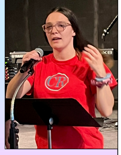
Learning to Lead!