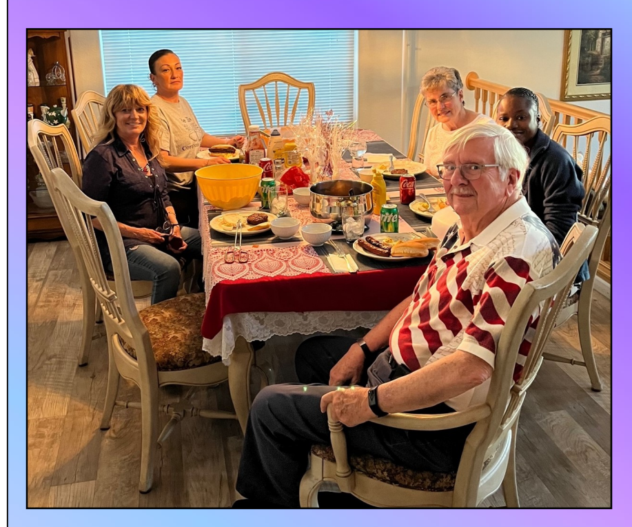
4th of July Dinner was a celebration!