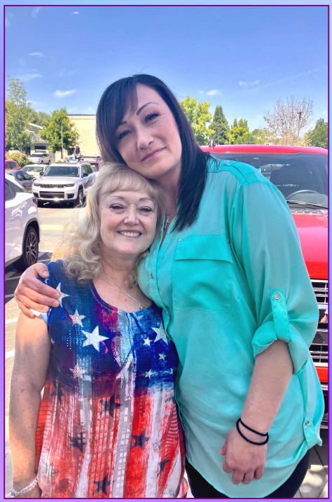
4th of July Picnic at South Reno Baptist Church