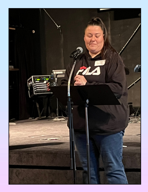
A Restart is always helpful!

10 year Sobriety Celebration of a changed life!!!