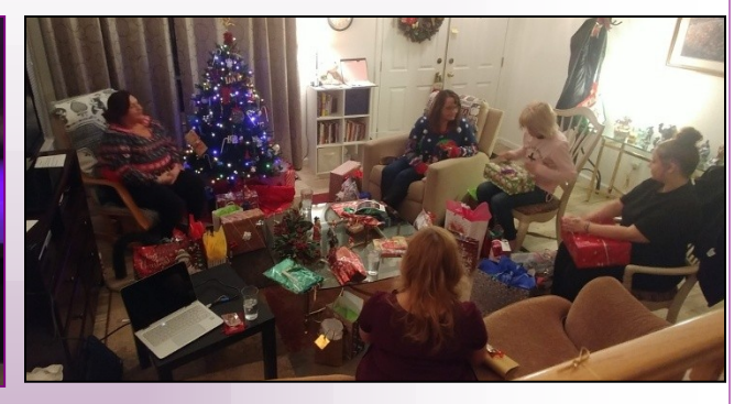
Christmas Eve at Hosanna Home