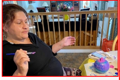
OCTOBER PUMPKIN PAINTING

Recreation is important for our residents so they grow in joy and have some fun! Check out these great projects!