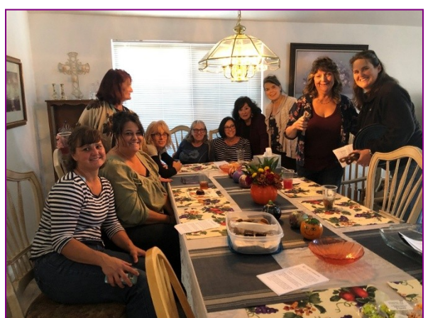
Shared a Meal

One of the areas that is highlighted is SERVICE. Here's what several of the Rooted Groups did to serve Hosanna Home: