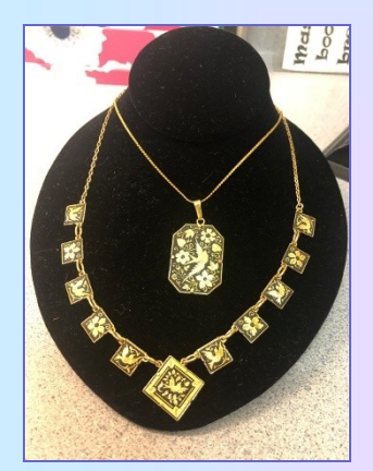
24 kt gold Jewelry

The amount of beautiful donations continues to bless and overwhelm our team of volunteers! Covid has reduced our volunteer count by many! Our customers continue to shop and find great bargains and beautiful treasures. Why not come in and see for yourself what the Lord is doing at Esther's Closet!