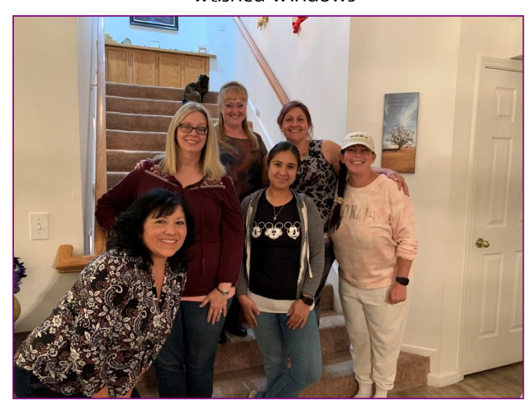
Shared their testimonies & love