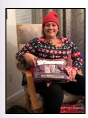
There were gifts of love!