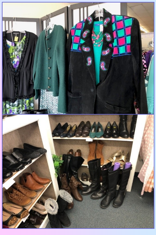
Name Brands & Shoes