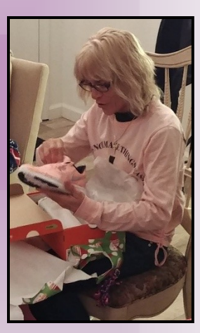
There were things to wear!