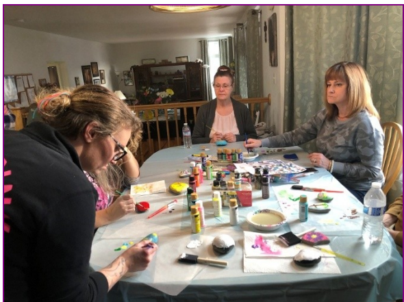
Worked on Crafts together