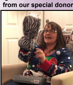
Even our House Mgrs were blessed!