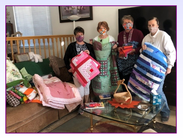
Holy Cross Quilts