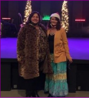
Christmas Eve Service at Summit Christian Church