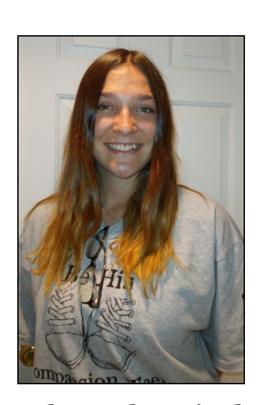
When Jade Arrived