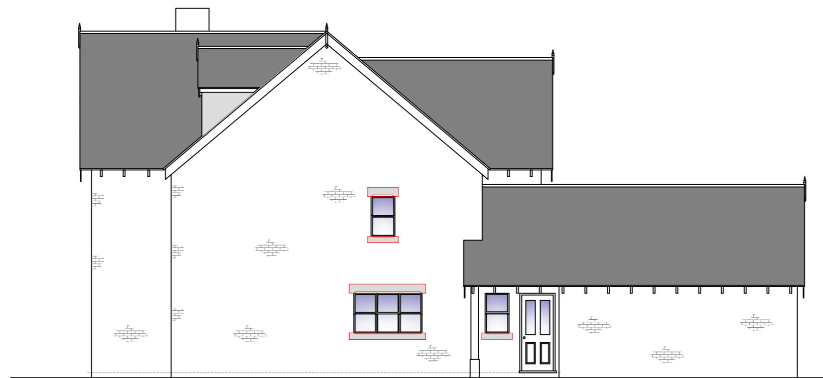
Side (NW) Elevation