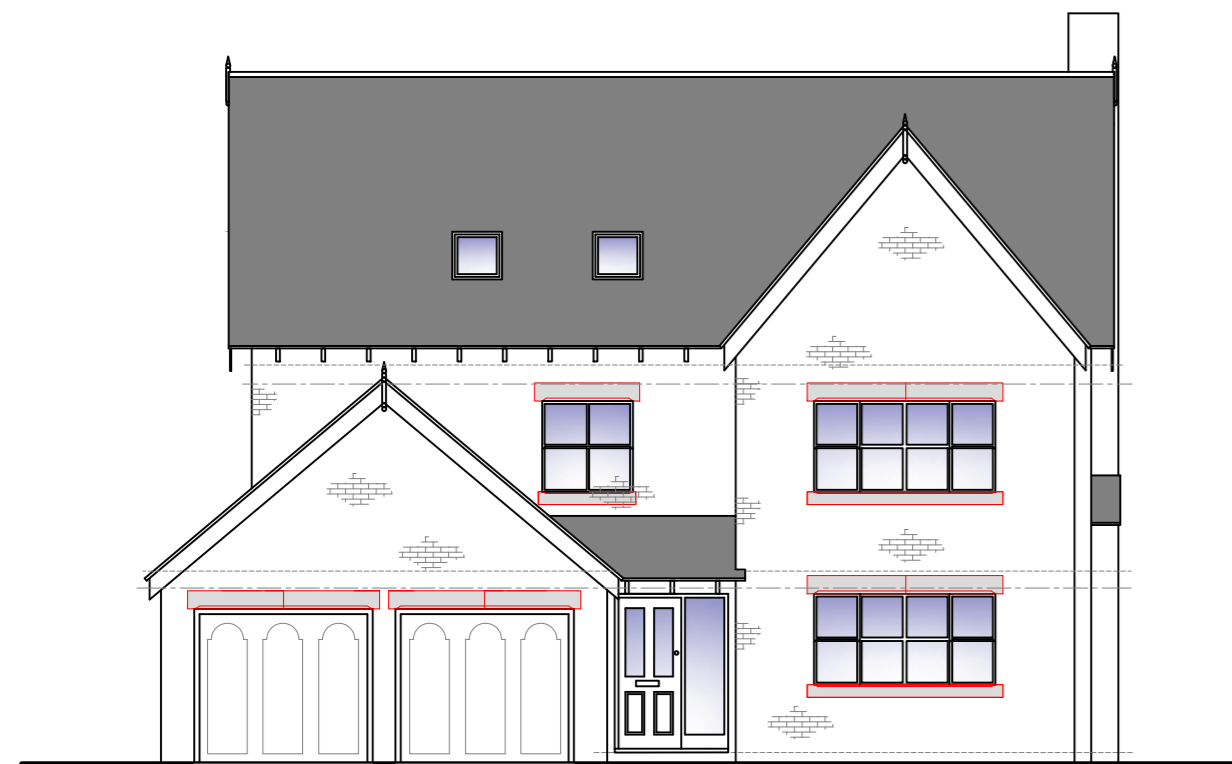
Front (SW) Elevation