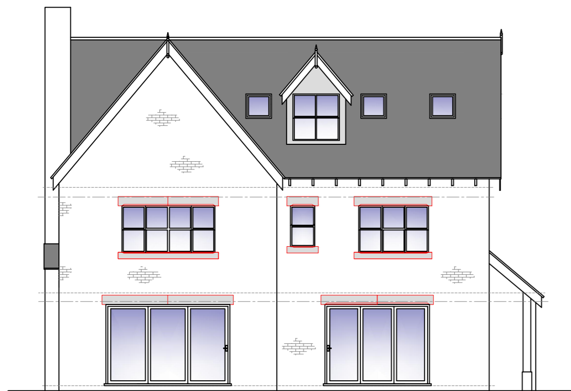
Rear (NE) Elevation