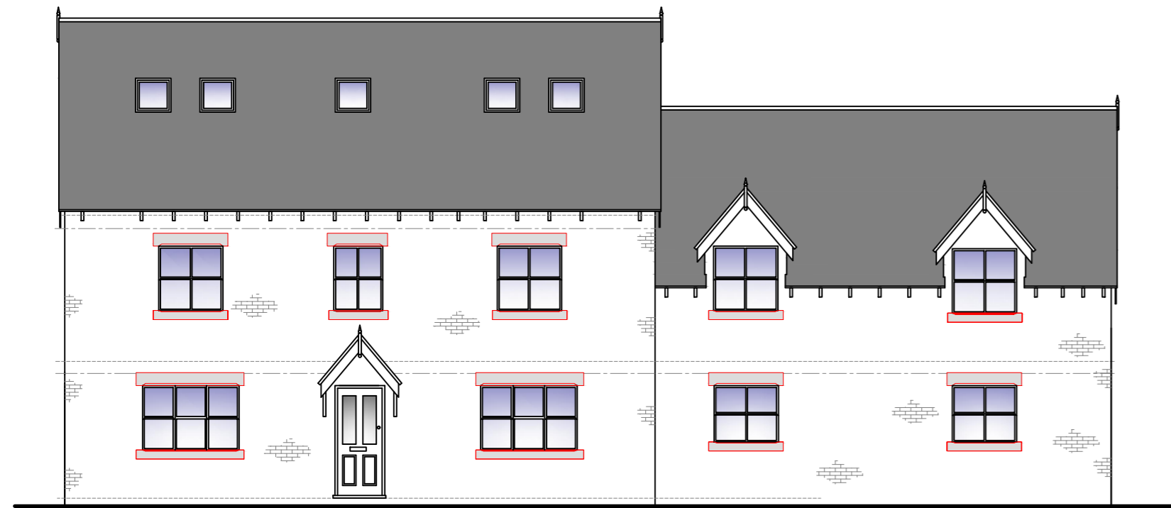
Front (NW) Elevation