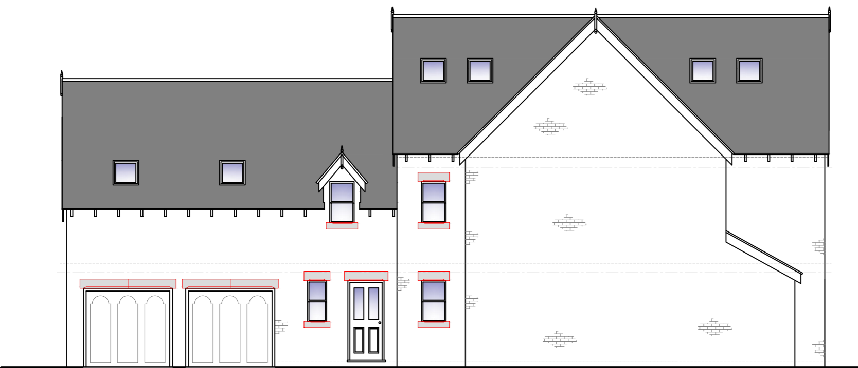
Rear (SE) Elevation