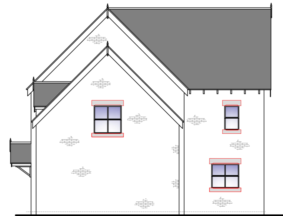
Side (SW) Elevation