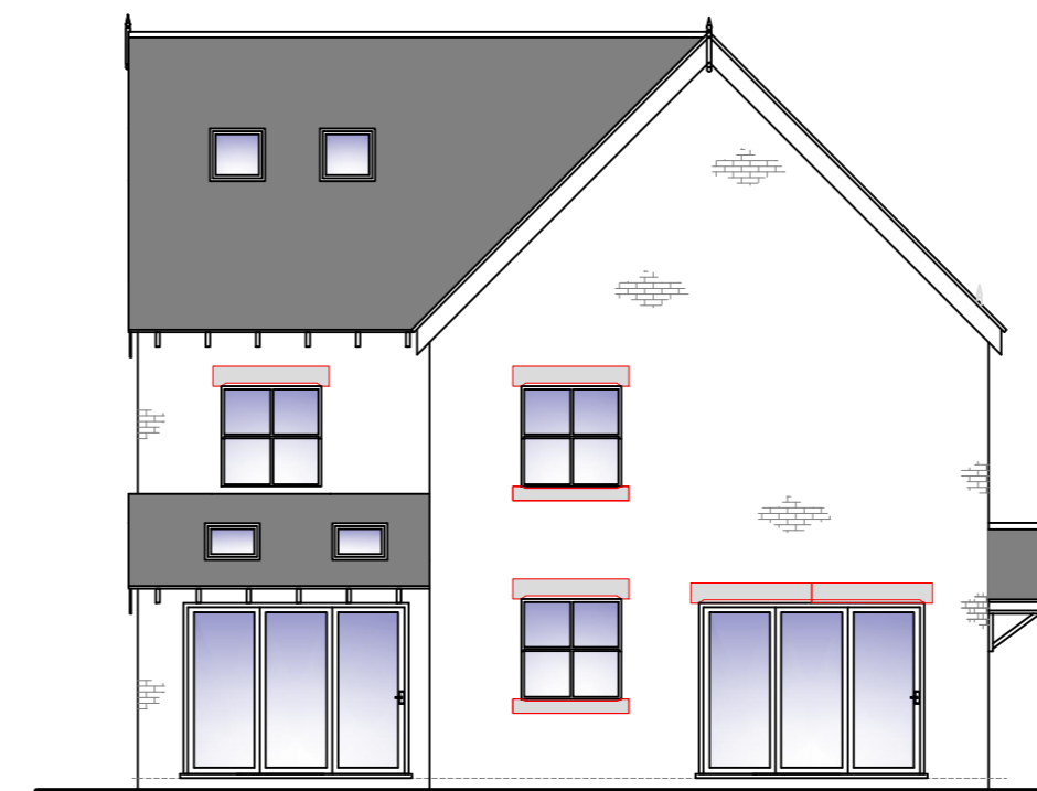
Side (NW) Elevation