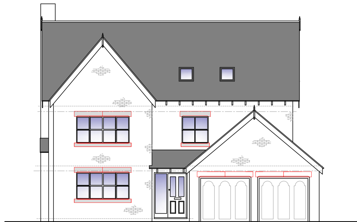
Front (SW) Elevation