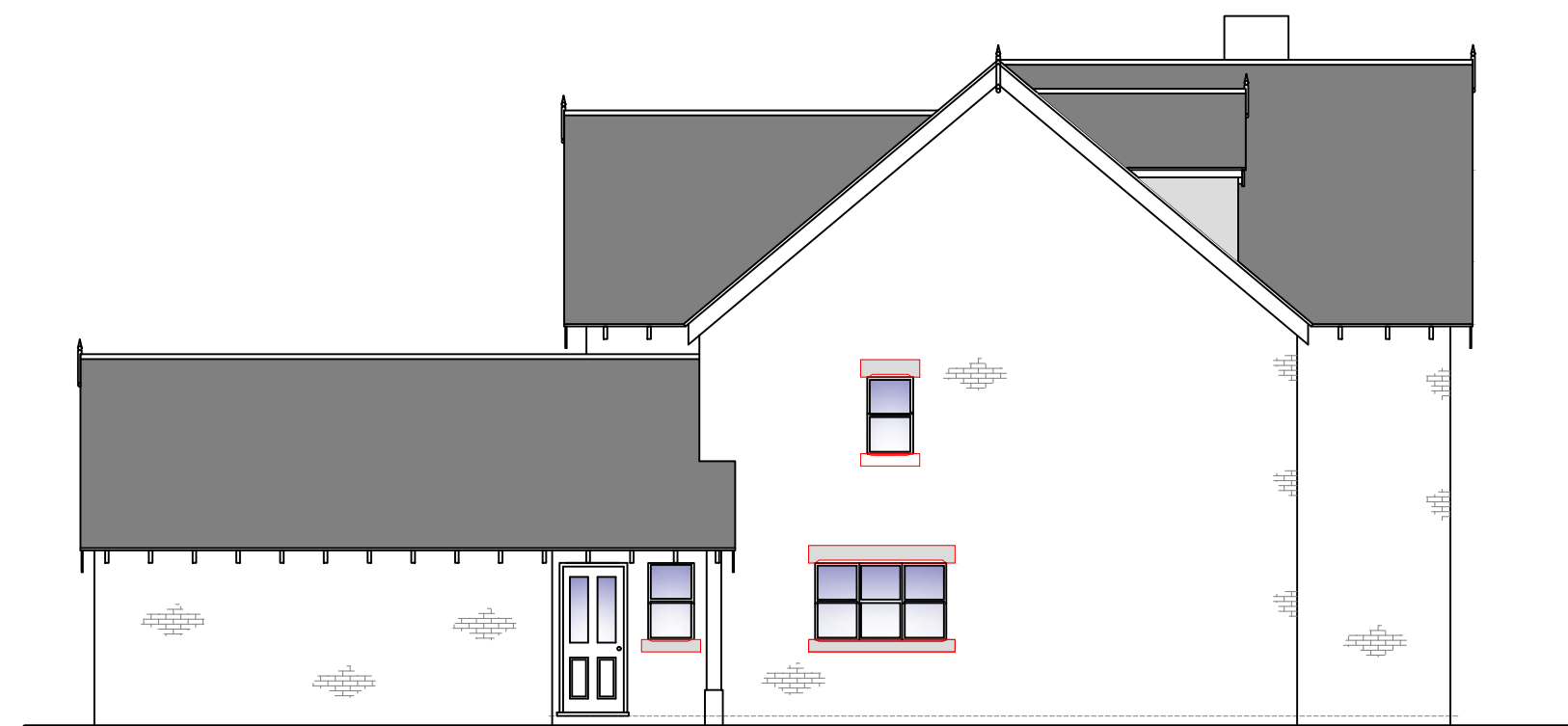
Side (SE) Elevation