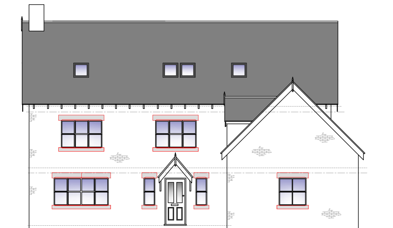
Front (SW) Elevation