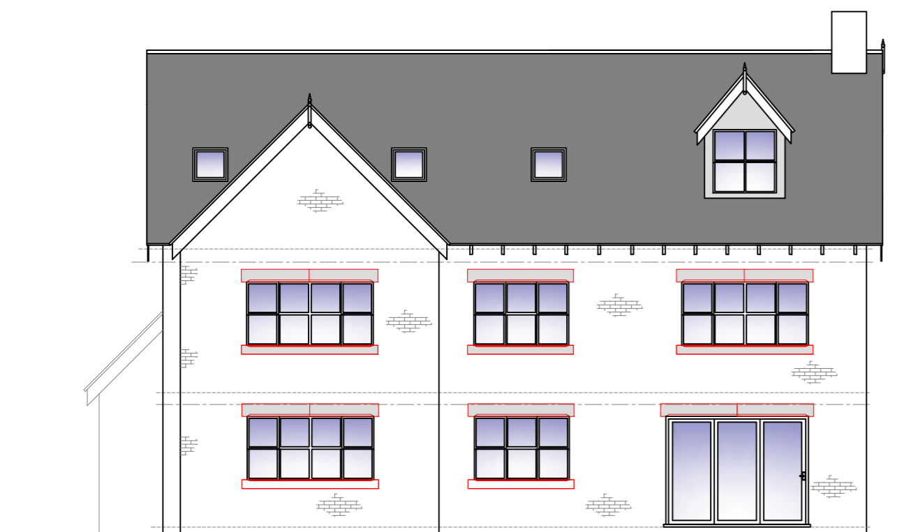
Rear (NE) Elevation