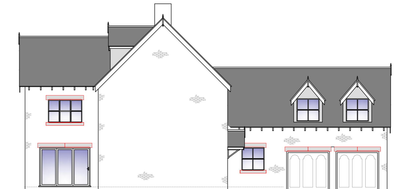
Side (NW) Elevation