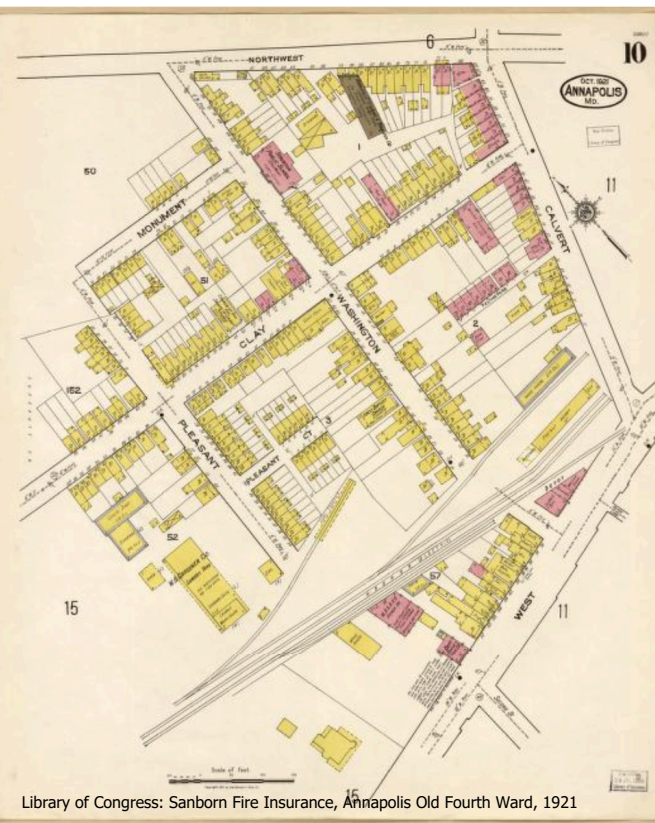
Sanborn Fire Insurance, Annapolis Old Fourth Ward, 1921