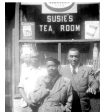
OLD FOURTH WARD PHOTOS OF residents, community, and businesses.