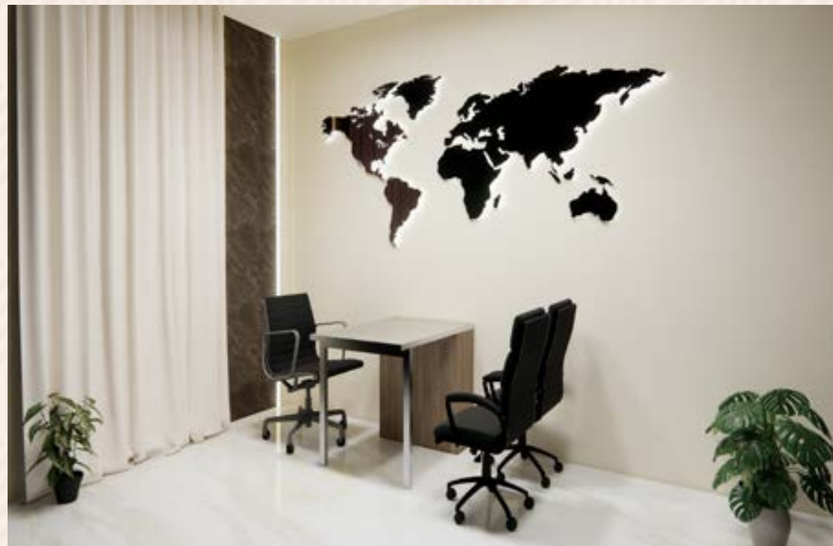
OFFICE ROOM / KIDS PLAY ROOM