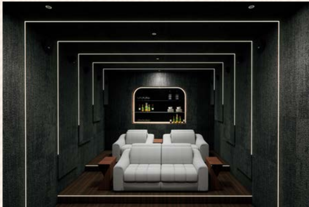
MOVIE LOUNGE / GUEST BEDROOM