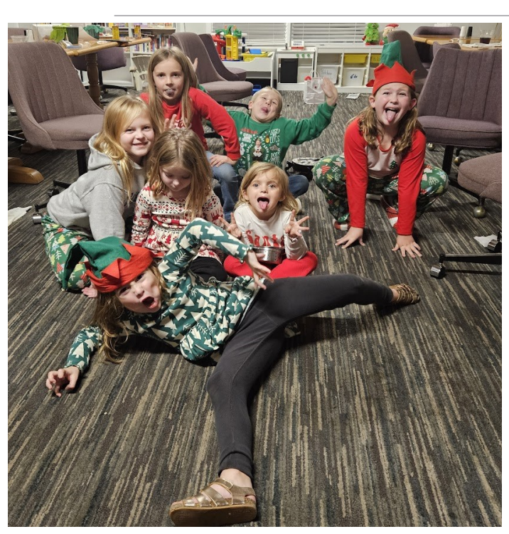
These "little Elks" are the greatest kids! It is good to see them playing in the kid's area of the Lodge after their Christmas Party. Thanks for picking up your toys afterwards. (It only took a little bribe.)

State Chair Drug Awareness Programs ecbsecretary@outlook.com | Cell 410-739-5575