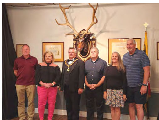
Welcome New Members