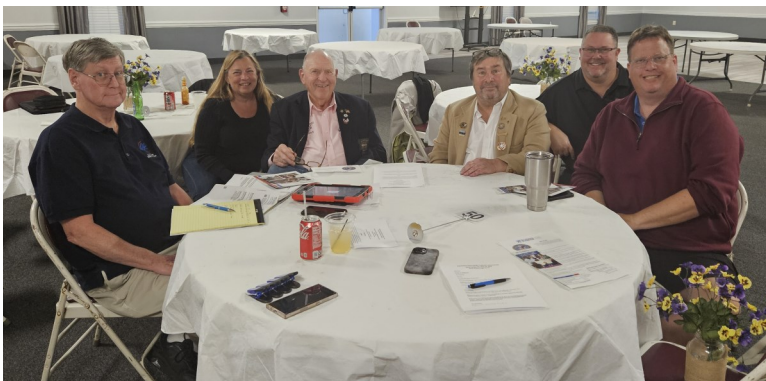
Members of the South East District Past District Deputies Association met at Kent Island Lodge #2576 for their regular meeting. The Association works to assist the District Lodges and District Leadership. After the meeting, they shared a meal and good fellowship.