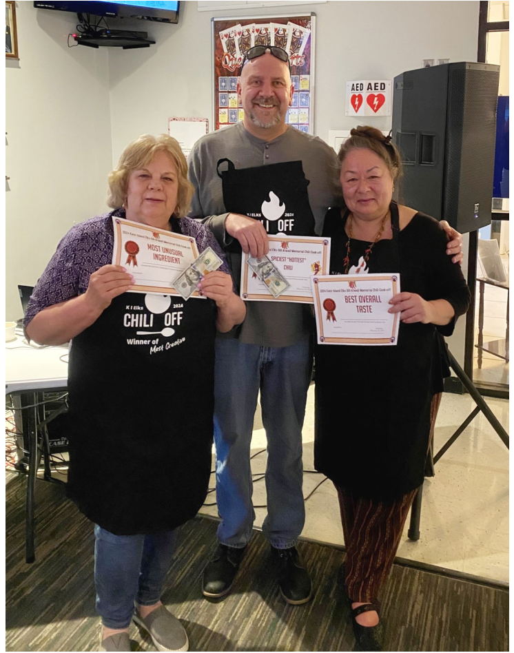
Pictured above, left: The three winners!