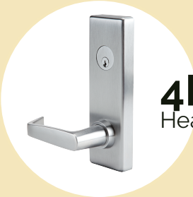
4EW Exit Trim Heavy Duty

Providing Commercial Doors and Hardware to the Modular Industry