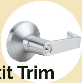
4S08 Exit Trim Standard Duty