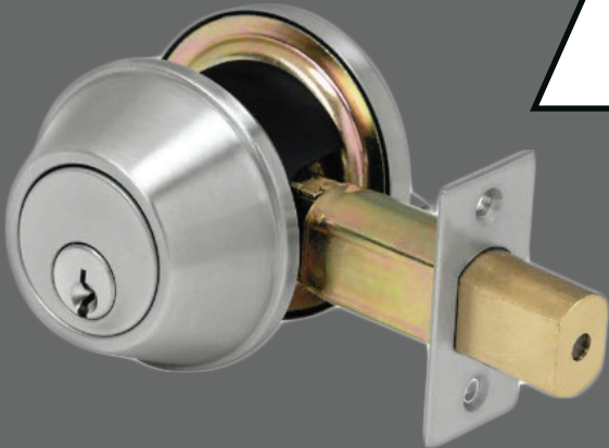
KV Series Deadbolt