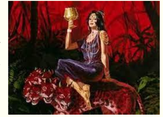
Recall from Rev 13: 6 = sum of numbers 1 + 2 + 3

The scarlet beast experienced death, resurrection and restoration. Together with the ten kings (global world powers), ruling as a single kingdom and one world government, they will be of one mind, giving their authority to the scarlet beast