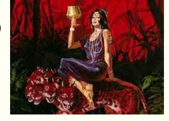
Scarlet and purple are colors worn by the pope, cardinals, bishops and archbishops of Rome

Scarlet is the color of blood, oppression and persecution of the saints of God