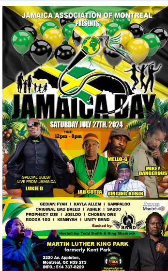
Jamaica Day in Montreal