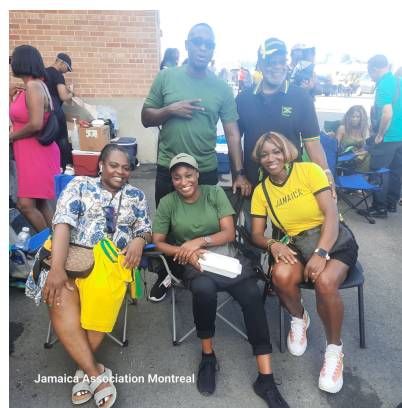
Members of the Jamaica Association in Ottawa for JAMDAY 2024, August 10, 2024