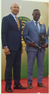
Award Ceremony – June 19, 2024