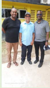
Black River – June 20, 2024

The Jamaica Association's Cool Runnings was in Martin Luther King Park (Kent Park) with other Community organizations for Canada Day 2024 (July 1, 2024).