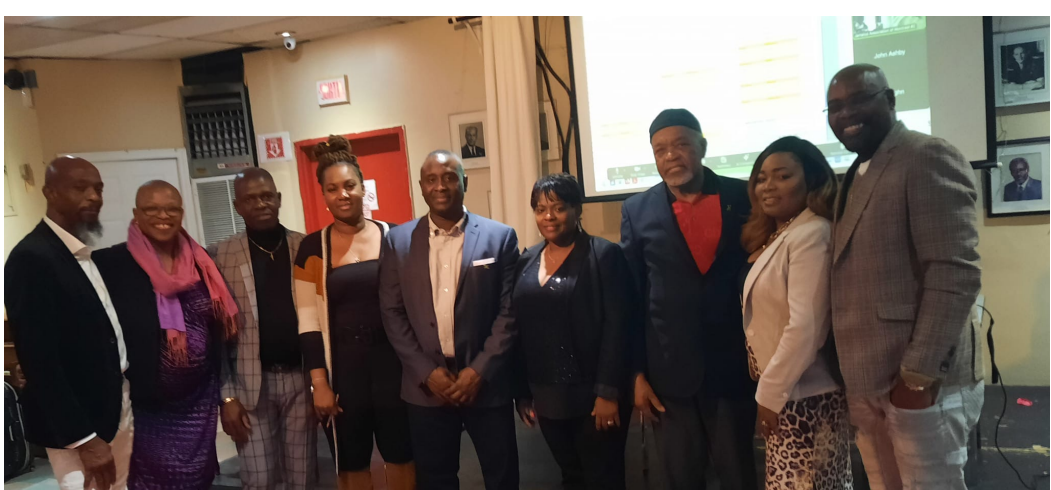
The newly elected board – election night December 9, 2023.

In fulfilling this Mission, the Association manages its operations to ensure the development of the community through economical, educational, cultural and social activities.