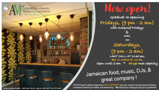
BAR MANAGEMENT – NEGRIL BAR