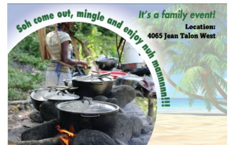
DUTCH POT SUNDAYS – BRUNCH EVERY 1 ST AND 3 RD SUNDAY AT THE ASSOCIATION – 11 AM to 3 PM