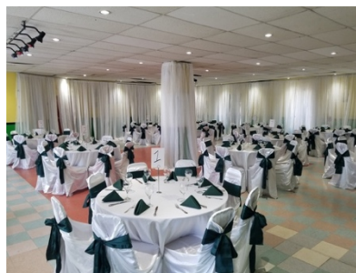
HALL RENTAL & BANQUET MANAGEMENT – MONTEGO BAY HALL