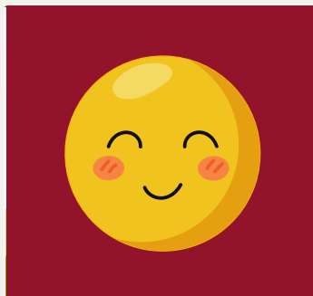
Your Picture Here Craft Fair Chair