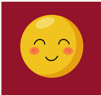
Your Picture Here Community Engagement