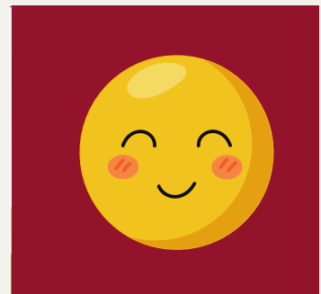
Your Picture Here Basket Auction Chair