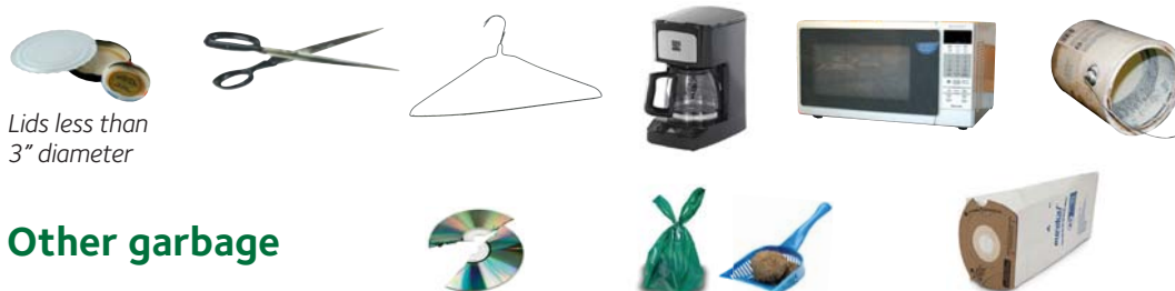
Lids less than 3" diameter