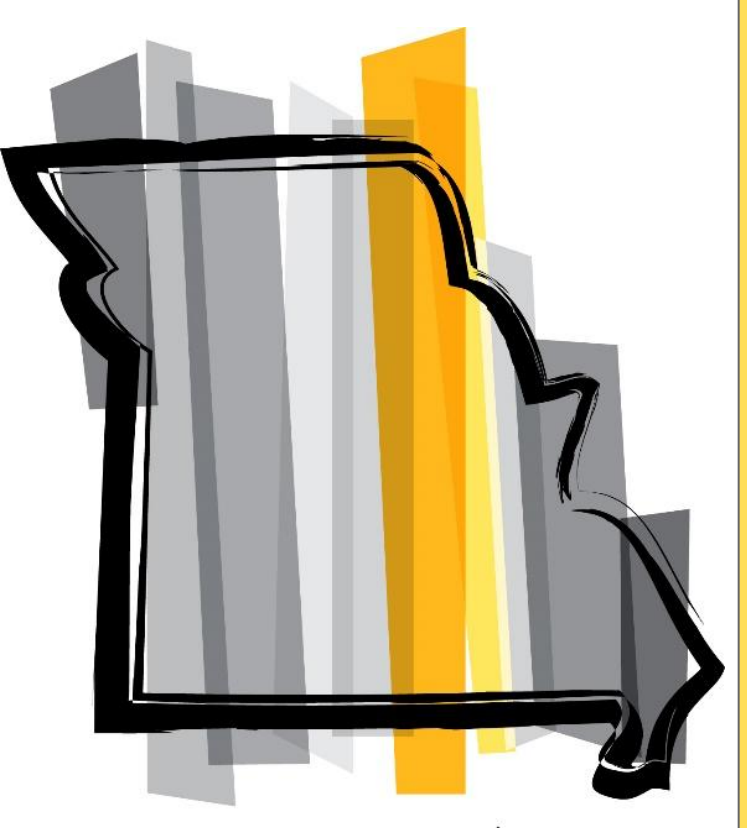
Missouri Citizens for the Arts