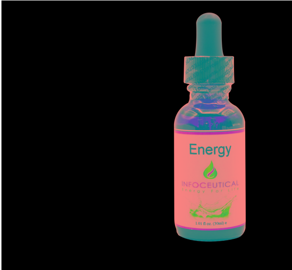
NES Health Scan | 7

It begins with spring water that we then deionize, or what is known as deeply demineralized. Therefore, it's an ultra-purified form of water that we begin with. We then add in some minerals from pink sea salt, potassium, and magnesium to aid in the structuring as EZ layers of water build around the hydrophilic surface of the minerals. We then ozonate the water which cleans, oxygenates, and structures the water (bubbles structure water). We then put it through a series of filters and bottle it. The end result is a solution that mimics the internal mineral balance of our blood. The infoceuticals are now ready for the imprinting process where we add information onto the structure.