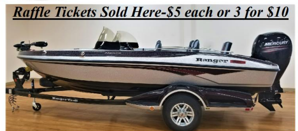
Raffle Tickets Sold Here-$5 each or 3 for $10