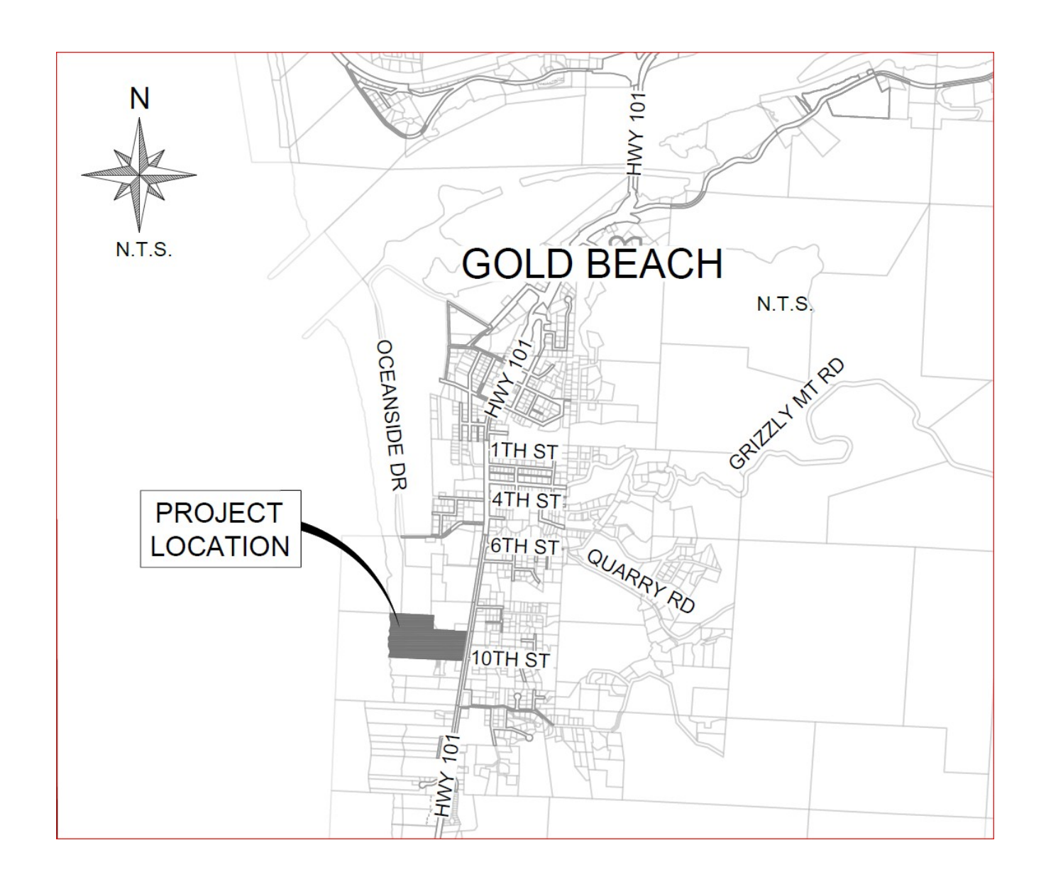
EXHIBIT VICINITY MAP