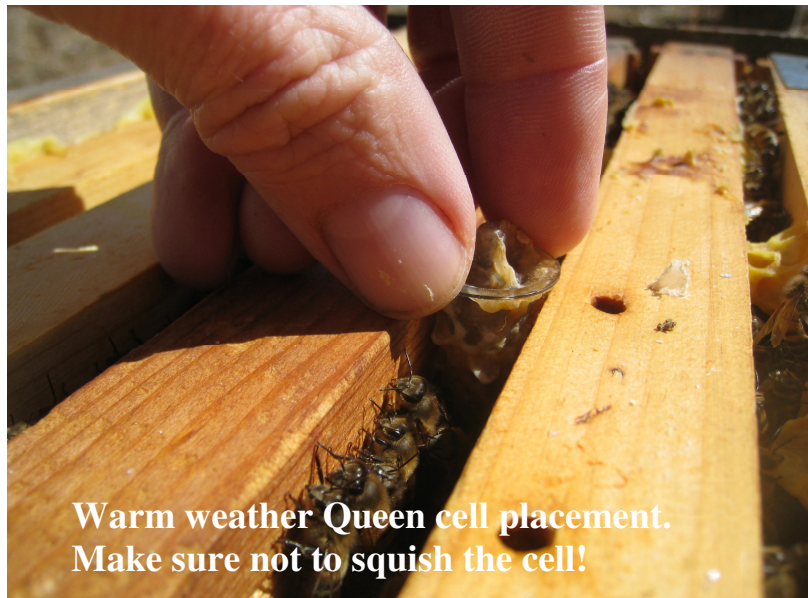
Warm weather Queen cell placement. Make sure not to squish the cell!

Place the Q-cell on a brood frame near the center of the cluster. To do this gently press the plastic rim into the comb next to the brood, about 3/4 of the way up the frame. This will ensure that the cell will stay at the appropriate temperatures. If the weather is warm and the population appears adequate, you can alternately place the cell between two top bars in the center of the cluster so the plastic lip of the cell cup suspends it. Make sure it is between two brood frames (optimally in the center of the brood nest), as the bees will abandon the Q-cell to keep brood warm if the weather turns cold!