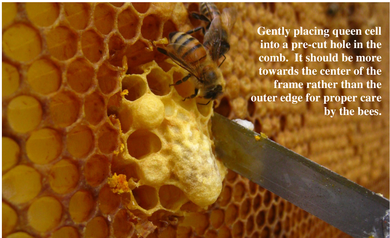
Gently placing queen cell into a pre-cut hole in the comb. It should be more towards the center of the frame rather than the outer edge for proper care by the bees.