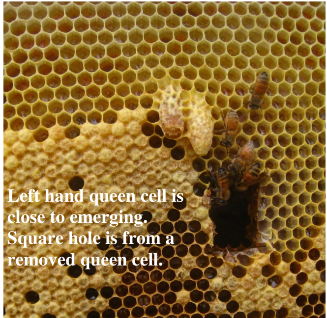
Left hand queen cell is close to emerging. Square hole is from a removed queen cell.