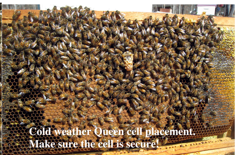
Cold weather Queen cell placement. Make sure the cell is secure!