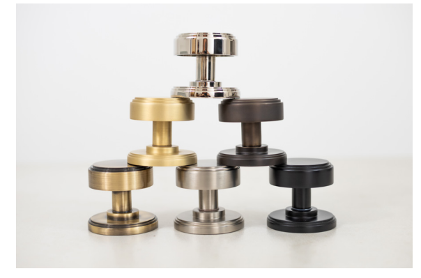
The Boulton design in Antique Brass is a perfect pairing.