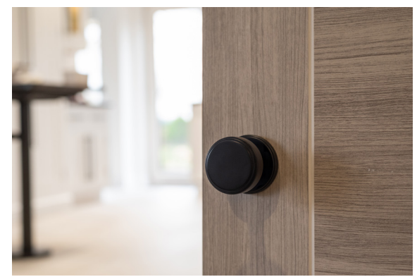
Atmospheric Urban Dark Bronze enhances the industrial design of this knob.