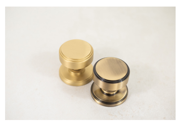
A clean, graceful design. Modern, detailed, yet elegant.