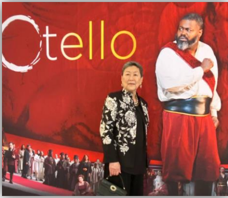
June 4, members enjoyed opera, Otello, at Dorothy Chandler Pavilion