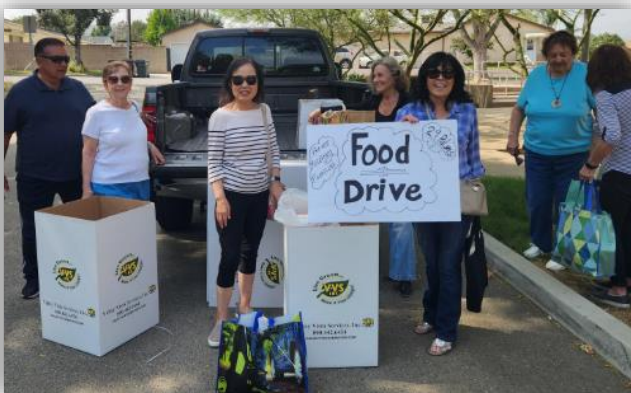
Food drive for military families at 29 Palms