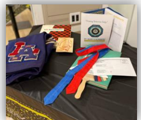
High School Memorabilia