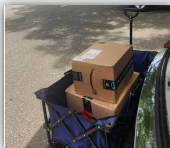
Angie delivered 216 boxes of 24 colored pencils to the Community Center for their back-to-school backpack giveaway program on August 2nd.