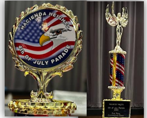
First Place Trophy from the 4th of July Parade.