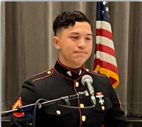
Young active marine thanked the Veterans for their service and sacrifices. His hope is to make them proud.