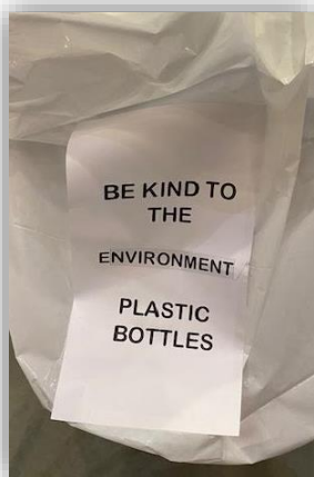
Bag to collect plastic bottles