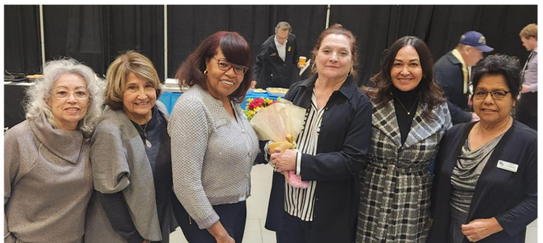
1/26 - Ladies at HHIA meeting in Community Center