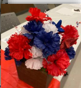
Table decorations by Laura Perez