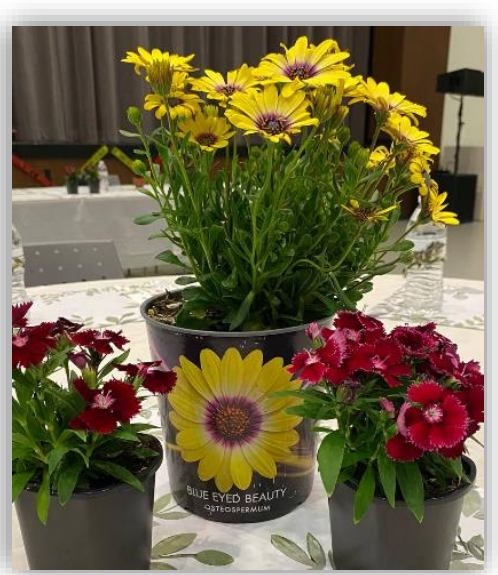
"When we plant trees, we plant the seeds of peace and hope." ~ Wangari Maathai

"Nothing ever seems impossible in Spring, you know." ~ L.M. Montgomery