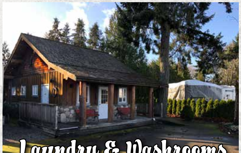
Laundry & Washrooms

Baywater Estates RV Resort , 6050 West Island Highway, Qualicum Beach, BC MAIL PO Box 814, Parksville, BC V9P 2G8