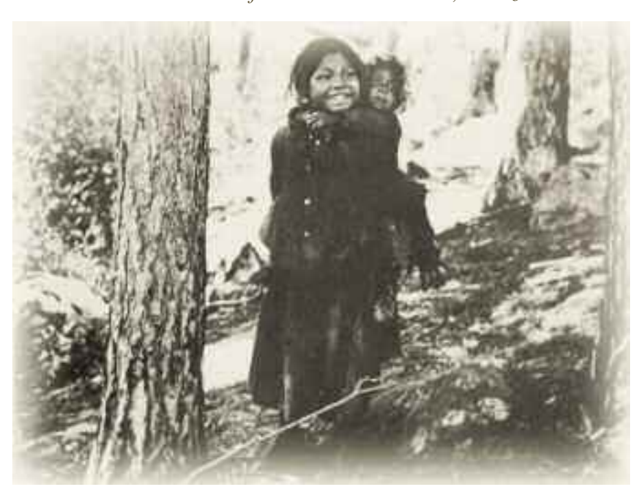
Bois Forte children of the Vermilion Lake district, about 1915

and families. Close by is a gymnasium and, where the dormitory stood, a community center with medical and dental facilities and a nutrition program for elders. There is a playground, a baseball field, and powwow grounds. The sidewalk that passed the school buildings is now surrounded by tall grass. It runs by the community center and ends at an empty field. The ruins of the sturdy cow barn-Superintendent Edsall once said that it housed the animals more comfortably than the dormitory did children<sup>46</sup>—stand as a community landmark across a now smoothly blacktopped road. From the ruins, the "farm road" leads to a new housing development on the site where hundreds of schoolchildren once worked long hours in the fields. A short distance away is the Fortune Bay Resort and Casino, built and run by the Bois Forte Band, which has made possible many of the recent improvements on the reservation. And next to the casino is the Bois Forte Museum and History Center