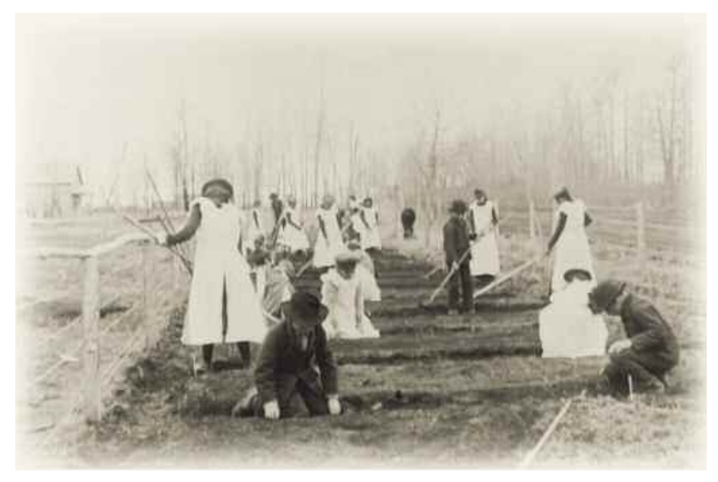
Children planting a garden at one of Minnesota's Indian boarding schools, about 1900

five more employees' cottages were built with the help of male students. The decade that followed was a relatively stable time. Attendance was good, and there was a consistent core of three or four dependable staff members, a turnover rate lower than at most boarding schools. But in many ways the school began to stagnate, as each of the succeeding superintendents became discouraged trying to communicate with a federal government-distant in miles and farther away in spirit—that required voluminous, highly regulated written reports and moved slowly in supplying the school's needs. Pleas for money to improve facilities went unmet, and the buildings began to deteriorate. Each superintendent from 1910 to 1919 requested money for repair, replacement, or additional