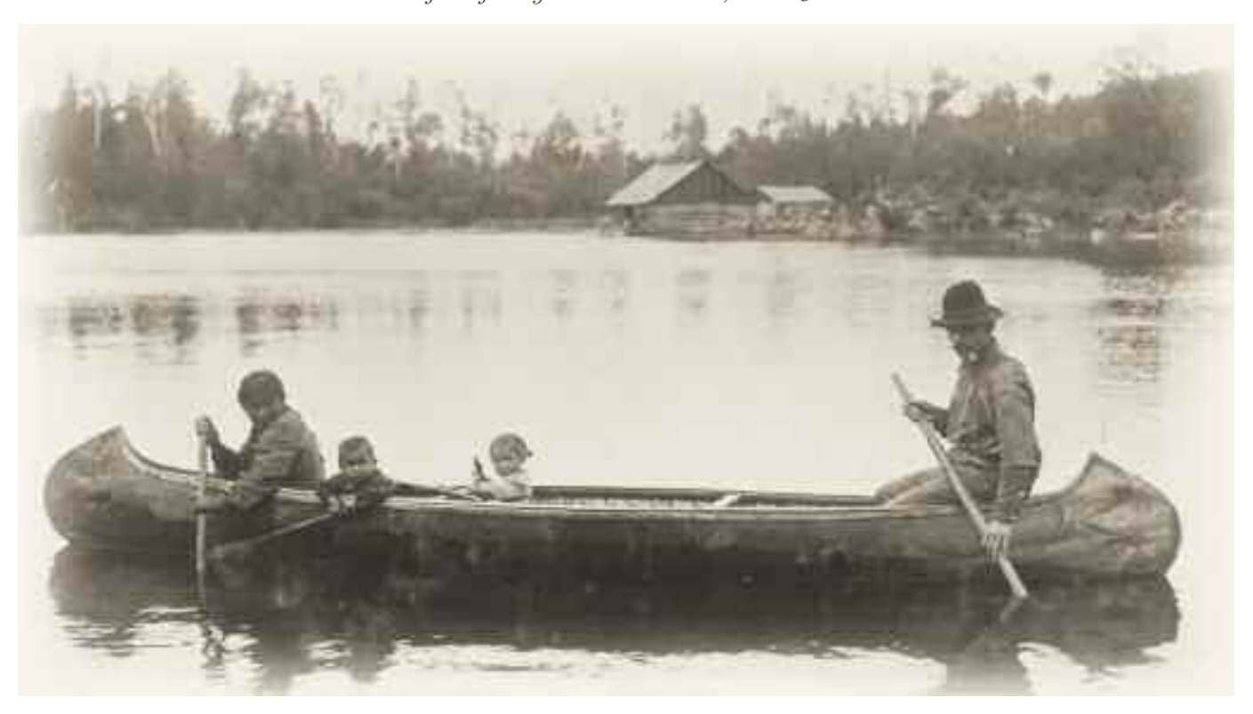
Ojibwe family on Lake Vermilion, about 1905

When Vermilion opened in 1899, it offered classes through the approximate equivalent of fourth grade; by 1911 its top level was comparable to today's sixth or seventh grade, although the students were generally older. The school was administered by a superintendent and between two and five teachers over the years, as well as support staff such as a cook, matron, and handyman. Although opened for Bois Forte children, the school enrolled students from other Oiibwe bands as well as other tribal groups from Minnesota, northwestern Wisconsin, and parts of Canada. In fact, in the early years, only about 20 percent of the pupils were Bois Forte. Absent were the 30-or-so students expected from Nett Lake. Although the day school had closed in the summer of 1898, parents resisted sending their children away.8