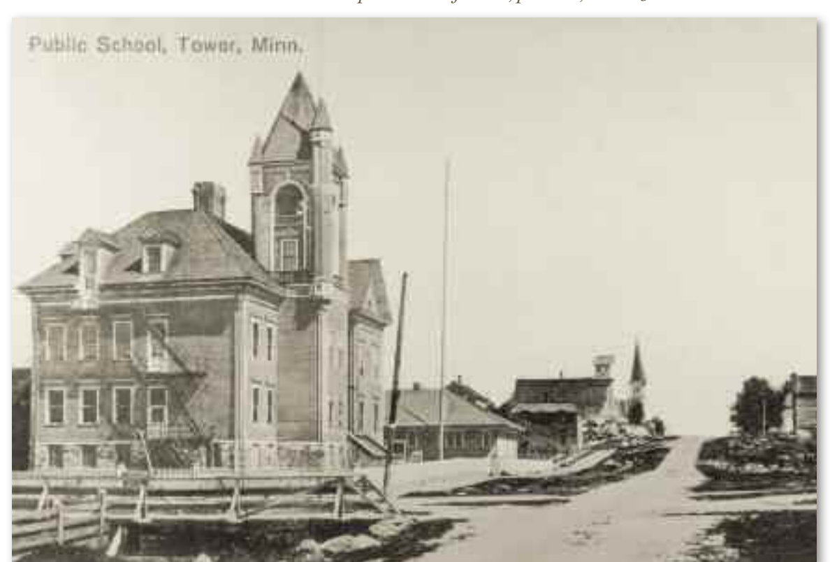
Public school in the still-unpaved town of Tower, postcard, about 1910