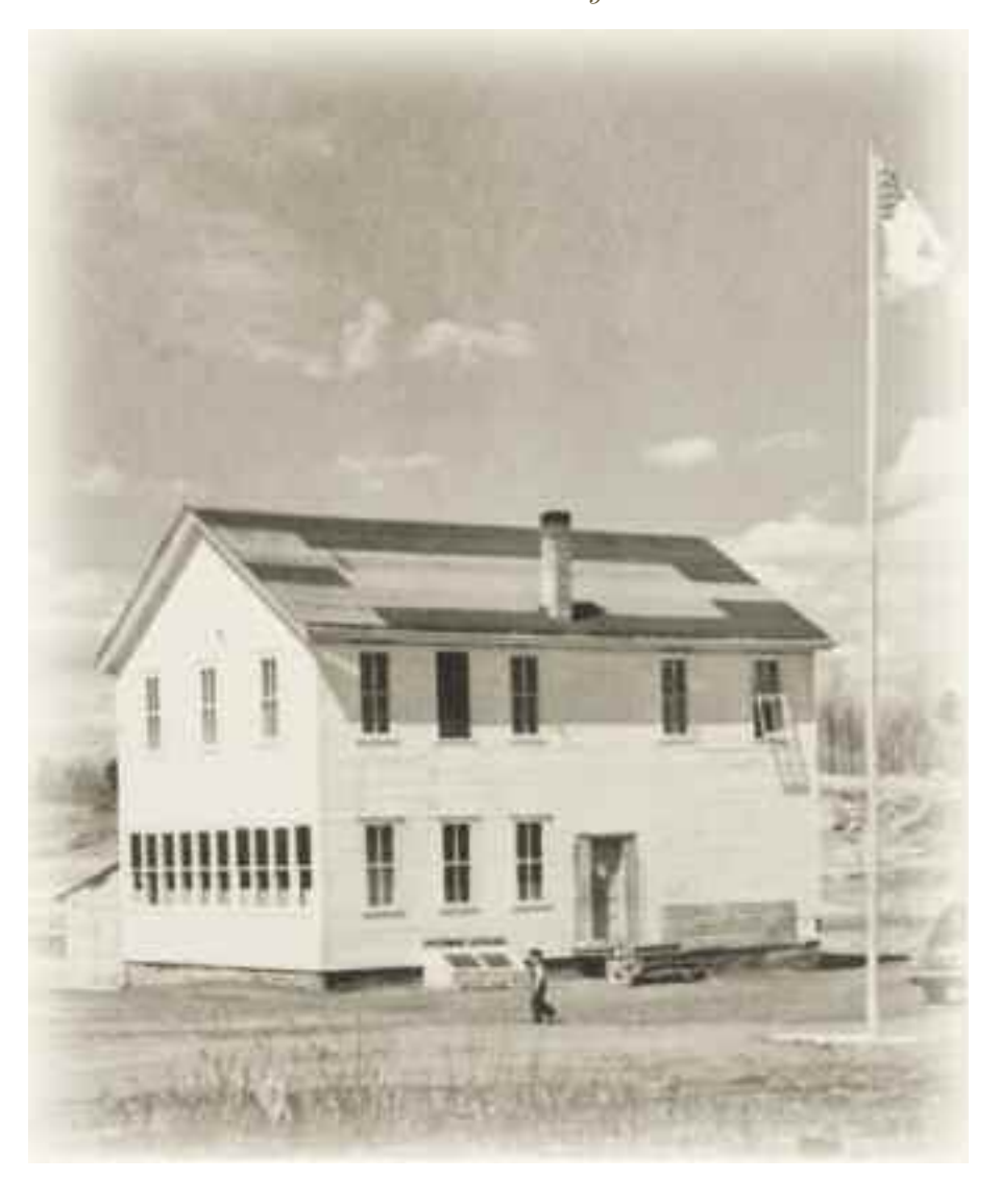
Vermilion Lake school building, about 1940, when enrollment totaled no more than 30 day students

In 1945 the Vermilion schoolhouse was remodeled. The exterior was painted, the classrooms, apartment, and lunchroom redecorated, and an oil-burning heater installed. Maps, globes, a set of encyclopedias, and new texts and library books were purchased. However, enrollment kept shrinking. In 1946 daily attendance averaged 19 of the 24 pupils enrolled—all day students from the