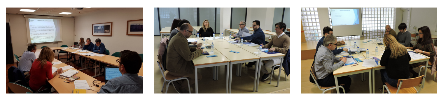
Round table discussions were held in the 3 Partnership countries

The Round table in Cyprus was organised by RTD Talos Ltd and was held on the 9th of April 2019 at the premises of the University of Frederick in Limassol.