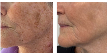
MY SKIN DEALER