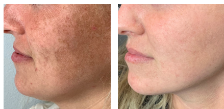
8445 MED SPA