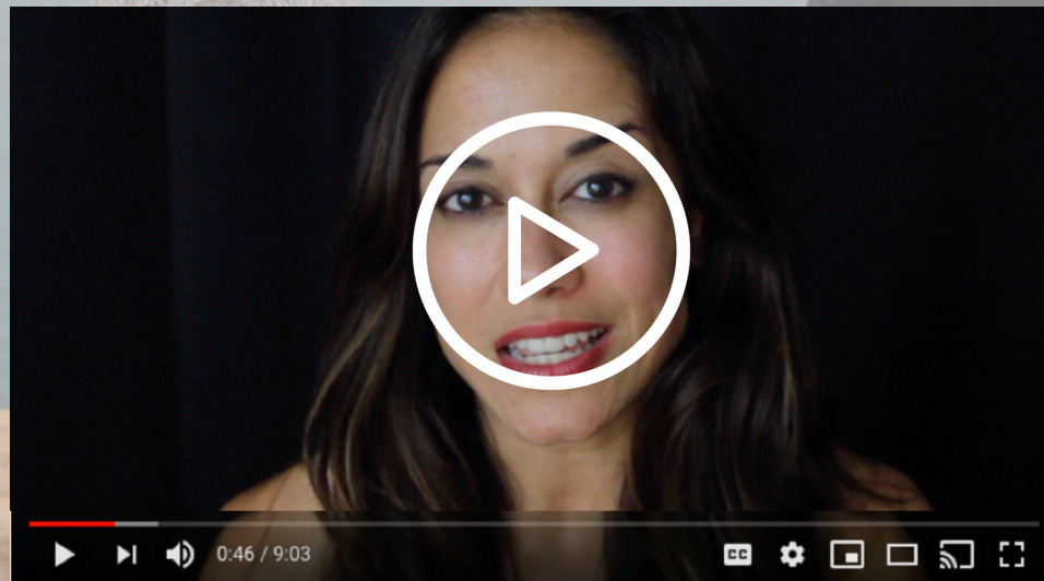
AN INTRODUCTION TO "BARE"