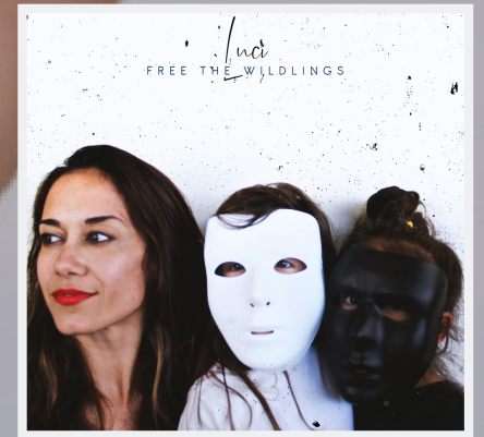
FREE THE WILDLINGS