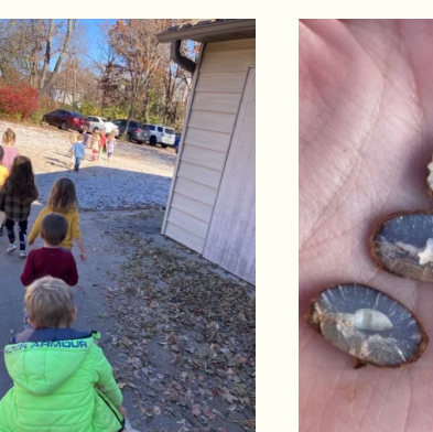
Pre-K walked to the persimmon tree in our parking lot then split the seeds! We see knives which they said is a cold winter!