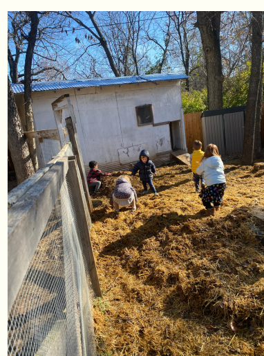
Help on the farm! Our kiddos helped to prepare the goat space for winter.