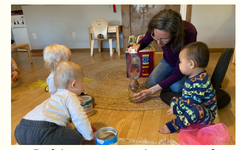
Babies were so interested as they started their potato to sprout!

Over the last month I have enjoyed providing all the wonderful activities our friends have been doing to participate in the Farm & Garden Program. By providing the opportunities we're hoping to continue our love and wonder of nature during these cold months. We have more fun garden projects for the next several weeks and hope you enjoy the pictures of our friends -Kaylee!