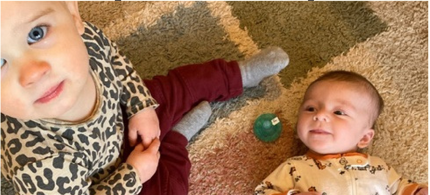
SWEET SOCIAL INTERACTIONS IN BABIES