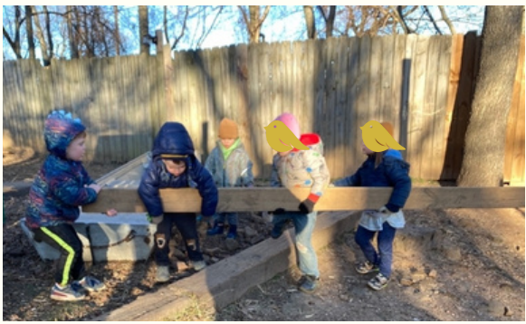
Working together to move their "equipment" to set up their play!