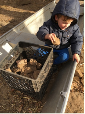
A boat & some rocks: "I'm putting my fishes back into the water because I can't eat them all."