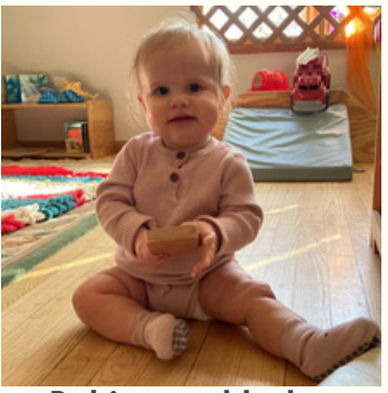
Babies use blocks as a phone!