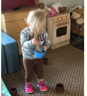
Using different sized containers to cook in the kitchen!