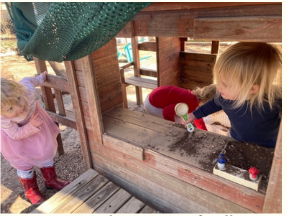
Dirt can be water or food! Your order is coming right up!