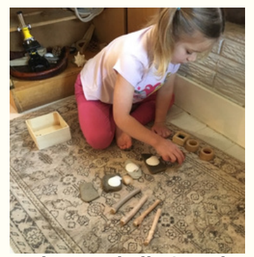
Rocks, seashells & sticks: "These are the steps that go up to the house!"