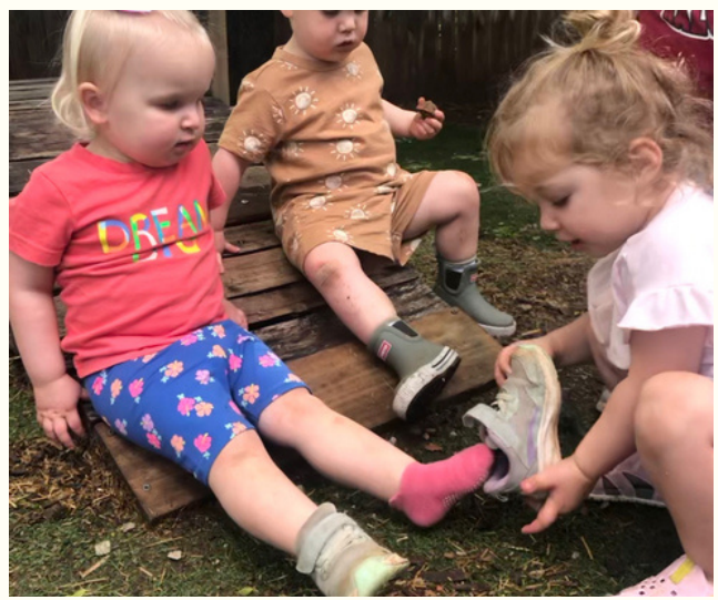
Children learn from their nurturing environments on how to care for others by watching their teachers and mimicking their actions.