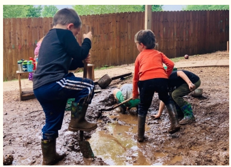
Sensory play in a group setting is one of our favorites that fosters social & emotional skills. Children are able to use creativity to collaborate and interact.