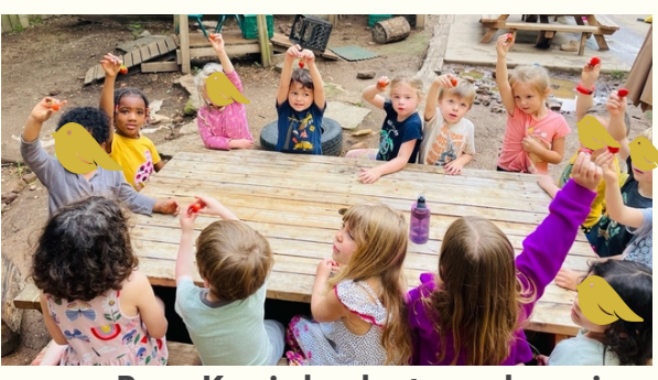
Pre-K picked strawberries from the garden!