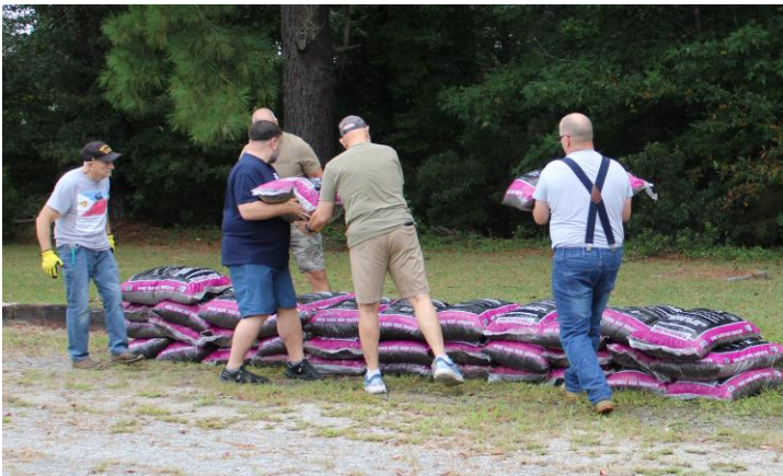
Members of VFW Post 2894 work together to stack over two hundred bags of donated mulch.

Thanks to all those who came out and helped unload the three pallets – it definitely ensured the task was completed efficiently and without any major injuries, although I am sure a few of us were feeling it later that evening and/or the next morning!