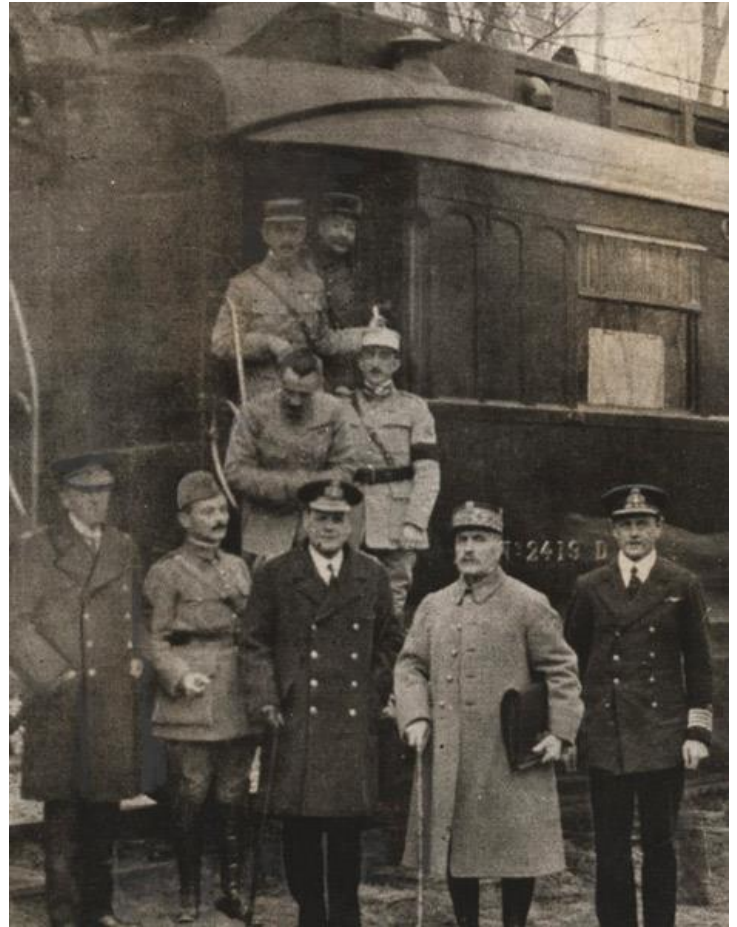
General Maxime Weygand of France, Admiral Wemyss of Great Britain and Marshal Foch of France, along with others involved with the Armistice, in the Forest of Compiègne on November 11, 1918, outside the railcar where the Armistice was negotiated.

When World War I began in August 1914, few expected the conflict to last beyond Christmas. Over the course of the next few months, however, it was clear this would not come to pass. The conflict, already expanded beyond Europe, included great movements of imperial colonies in Africa and Asia. As it progressed, further independent nations like Bulgaria, Romania, Italy, the Ottoman Empire, China and Japan joined the fighting. Not until 1918 would the war's end be in sight. In October of that year, an armistice between the Ottoman Empire and the Allies ended fighting in the Middle East. Only days later, the disintegrating Austro-Hungarian Empire signed an armistice with Italy.