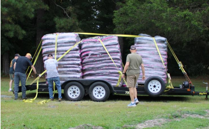
Volunteers from VFW Post 2894 prepare to offload three pallets of mulch donated by a local Home Depot

Thanks to all those who came out and helped unload the three pallets – it definitely ensured the task was completed efficiently and without any major injuries, although I am sure a few of us were feeling it later that evening and/or the next morning!