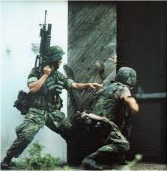
Soldiers from the 2nd Brigade Combat Team, 82nd Airborne Division, conduct clearing operations during the Grenada invasion, October 1983.

resulted in the liberation of 233 students with no resistance from the campus police force.