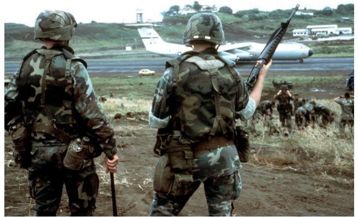
U.S. soldiers carrying M16A1 rifles watch an aircraft arrive in Grenada as part of Operation Urgent Fury, the U.S. invasion, November 3, 1983.

Ranger Regiment, the 82nd Airborne Division, elements of the former Rapid Deployment Force, U.S. Marines, U.S. Army Delta Force, Navy SEALs, and a small group Air Force Tactical Air Control Party personnel, a total of 7,600 U.S. troops. Together with Jamaican forces and Regional Security troops, the assault units quickly defeated Grenadian resistance after a low-altitude assault by the Rangers and 82nd Airborne at Point Salines Airport on the island's south end, and a Marine helicopter and amphibious landing at Pearls Airport on the north end. The main objectives on the first day were for the 75th Ranger Regiment to capture Point Salines International Airport in order for the 82nd Airborne Division to land reinforcements on the island; the 2nd Battalion, 8th Marine Regiment to capture Pearls Airport; and other forces to rescue the American students at the True Blue Campus of St. George's University.