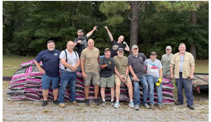
Post VFW 2894 volunteers pose for a picture after successfully completing the offload of the three pallets of hardwood mulch.