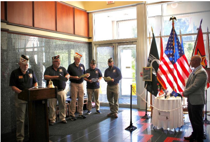
VFW Post 2894 members participate in the annual POW/MIA Commemoration Ceremony at Chesapeake City Hall on 19 September.