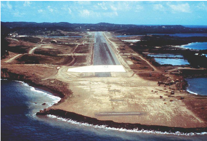
Point Salines International Airport, Grenada, in 1983.

The Bishop government began constructing the Point Salines International Airport with the help of the United Kingdom, Cuba, Libya, Algeria, and other nations. The U.S. government accused Grenada of constructing facilities to aid a Soviet-Cuban military buildup in the Caribbean based on the fact that the new airport's 9,000-foot runway would be able to accommodate the largest Soviet aircraft. Such a facility would enhance the Soviet and Cuban transportation of weapons to Central American insurgents and expand Soviet regional influence.